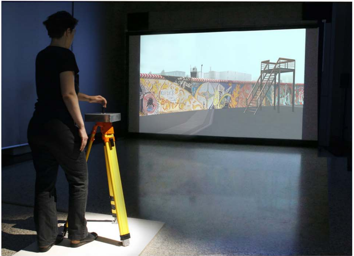
Fig. 1: Virtuelle Mauer/ReConstructing the Wall by Tamiko Thiel, Teresa Reuter & Sabe Wunsch, Berlin, 2008.

In doing so it investigates a novel mix of nostalgia “the sublime” and “pregnant” reconstructions of the negative affects of restrictive urban division. The sublime in this case is not the overpowering and uncontrollable effects of nature by the individual, but a human construction that grew wildly and ended evoking both awe and fear.