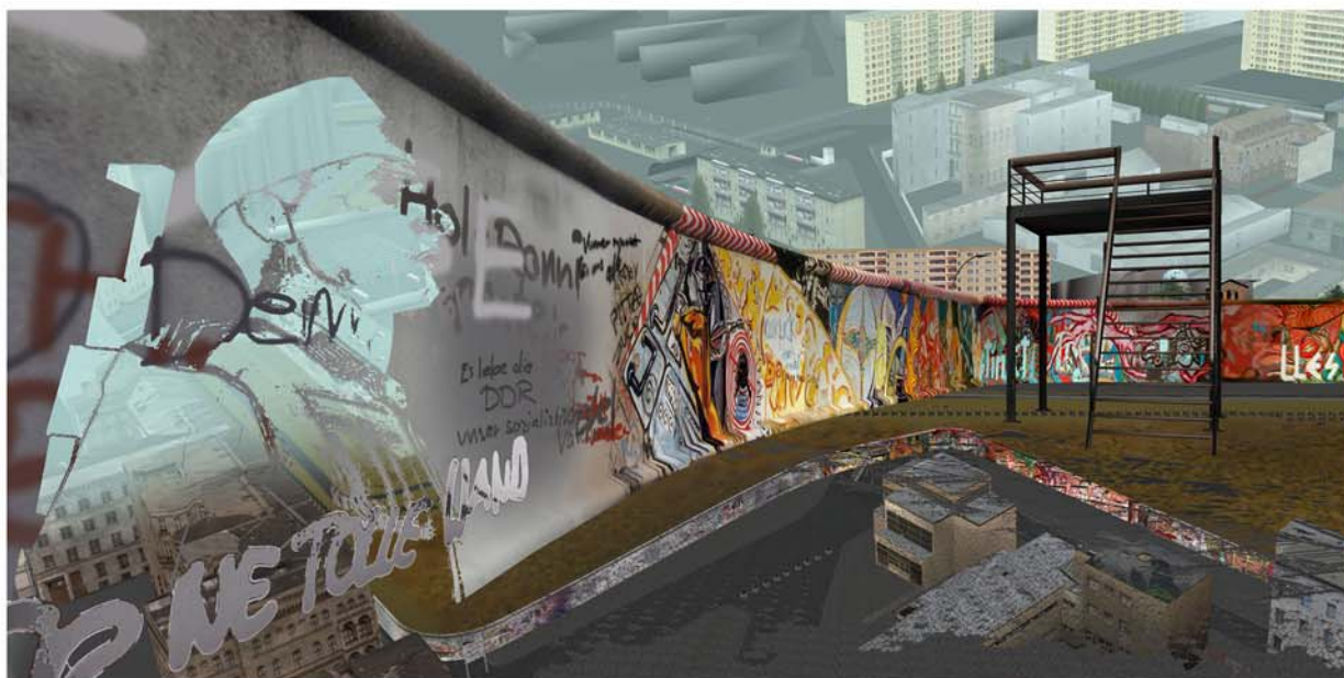
Fig. 2: Border Soldier Luckauerstrasse, Tamiko Thiel, Berlin 2008.